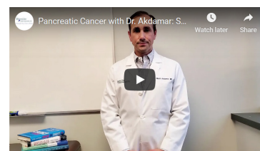
Pancreatic Cancer: Screening Tests