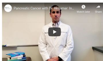
Pancreatic Cancer: Introduction

You can also click on the links of the videos listed below, that answer each of the questions previously stated.