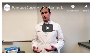
Pancreatic Cancer: Symptoms