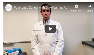
Pancreatic Cancer: Risk Factors