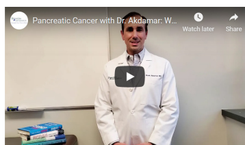
Pancreatic Cancer: What is it?