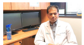
What to Consider with IBD and a Pandemic