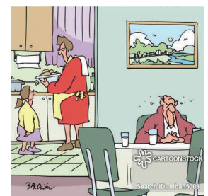
"No bread for Grampa. He's on a gluten-free diet."

Read the article titled simply: Celiac Disease